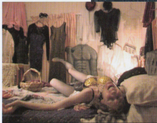
Linda Murray The Hoarder 2 , 2006, DVD still