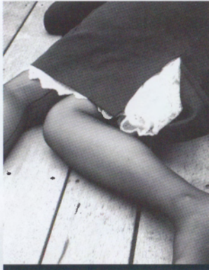
Simone Hine Production Still 1 – Interior, 2006, photograph