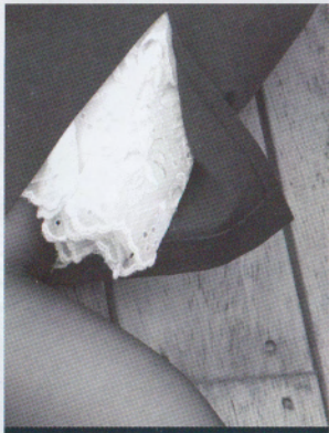
Simone Hine Production Still 2 – Interior, 2006, photograph